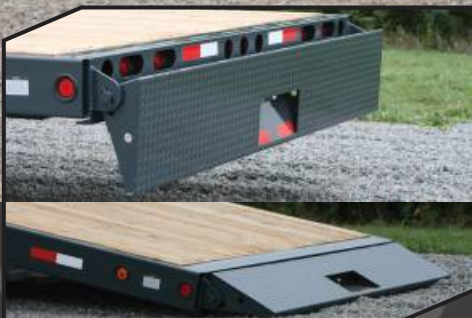
Patented automatic kick-out ramp doubles as under-ride protection.