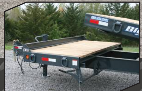
Standard 4-foot stationary deck gives room for longer equipment and makes towing easier.