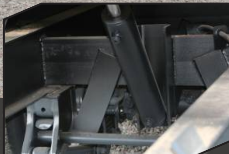
Cushion cylinder controls the deck from slamming when loading or unloading equipment. Optional Hutchens 9700 suspension shown.